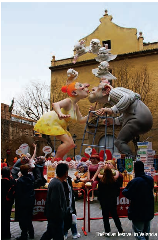
The fallas festival in Valencia

Electricity (10A) £3.15. Dogs/Cats free of charge. Car with motorhome free of charge. Extra car £3.60. Tourist tax included.