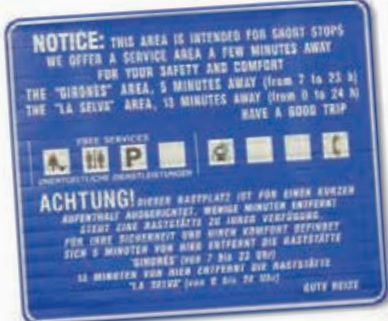
Above: One of the advisory signs on Spanish motorways Left: On the free A75 motorway in France, crossing the famous Millau viaduct, the highest bridge in the world

The Club does not recommend stopping overnight in lay-bys or service stations, whether on motorways or on other roads. Please be sure to read Carefree's Guide to Winter Sun holidays on pages 80-93, which is packed with advice based on our many years of experience, as well as that of Club members.