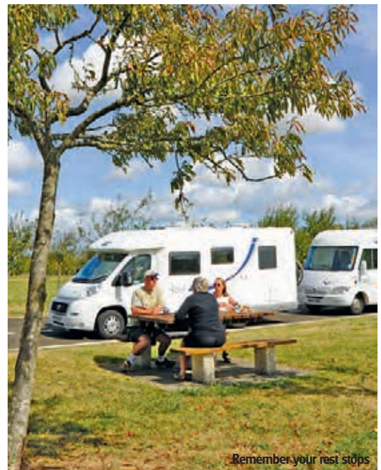
Remember your rest stops

Many members like to take their time travelling and make time to visit some interesting sites on the way. Several of the En Route campsites we use are close to places of interest and/or of better quality than just a basic stopover, so we think that they warrant more than just an overnight stop. These are indicated by ✨. Campsites, mostly open all year, that also appear in the Carefree Summer brochure are indicated by ▲.