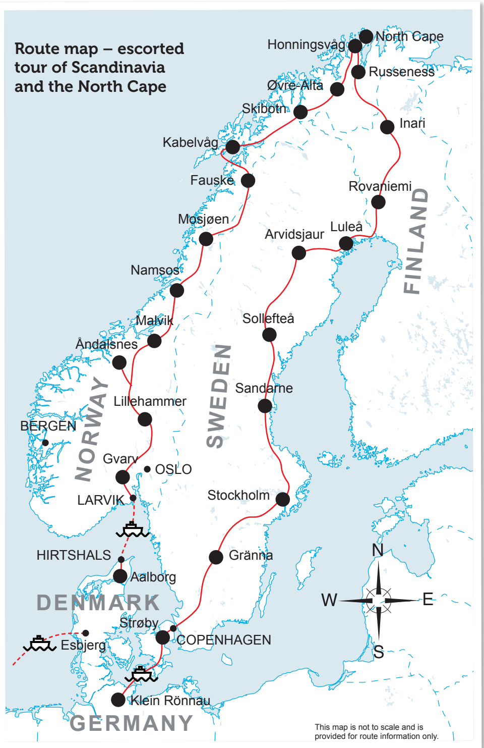
This map is not to scale and is provided for route information only.