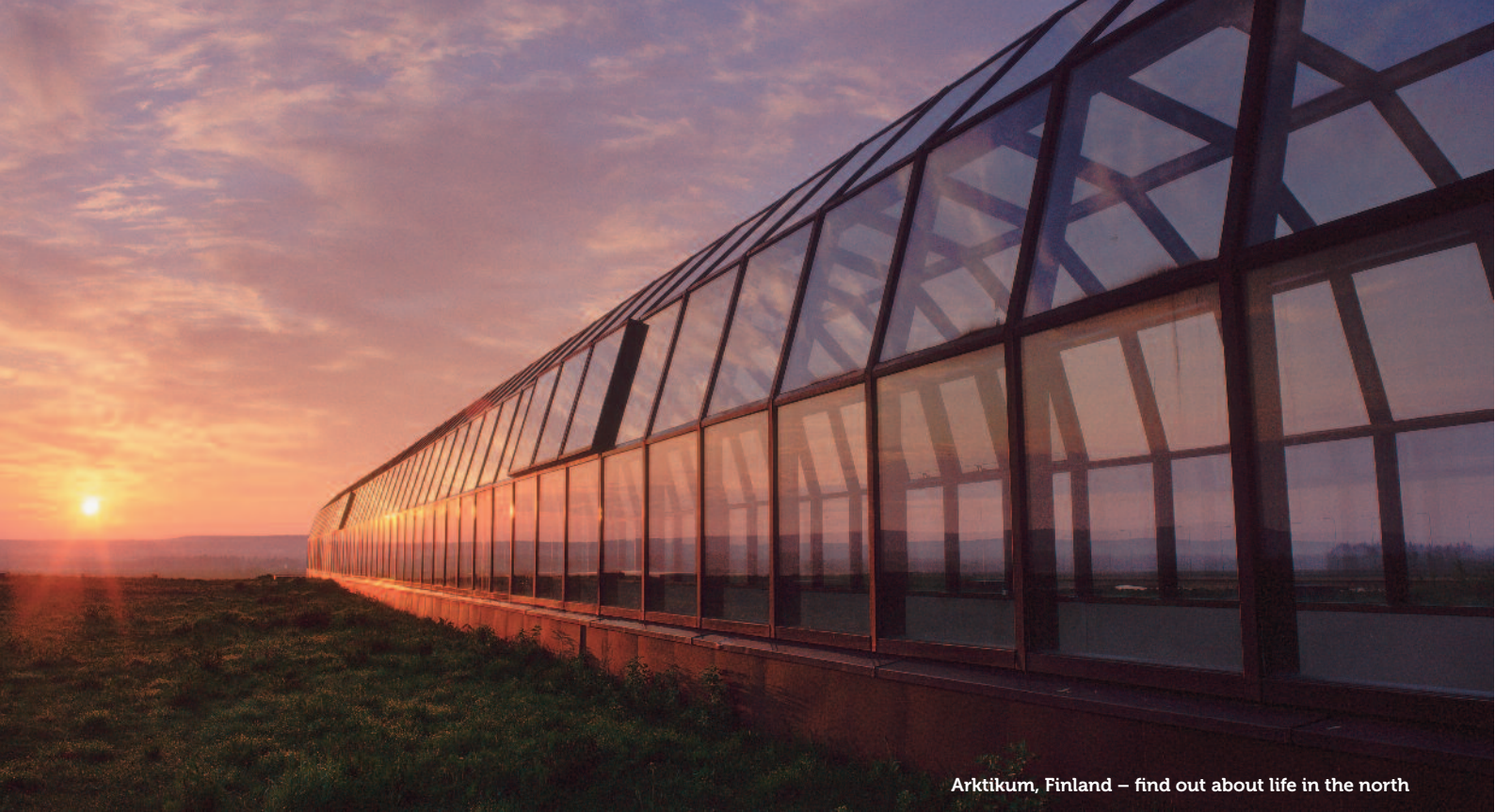
Arktikum, Finland – find out about life in the north