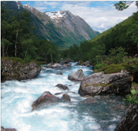
Enjoy fabulous scenery along one of the world's Top 10 driving routes