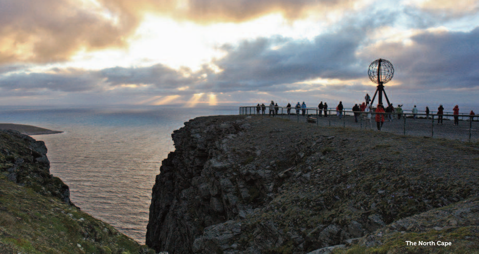
The North Cape